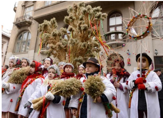
Photo: Carolers with stars present traditional Christmas play (vertep) near the most beautiful cathedral in Lviv - the Dominican church, which survived in Soviet times only because it was a museum of atheism. «Soli Deo honor et gloria» - an inscription under the dome of the church – can symbolically mean that with the God's help Ukrainians can now have it's own free country with the authentic religion, traditions and languages. During Soviet times carolers with their whole families were often sent to Siberia or even shot.